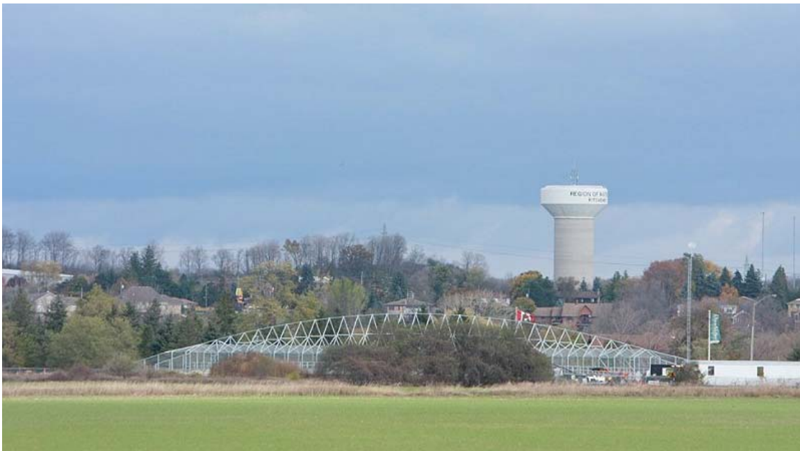
The Bridge is a welcome addition to our changing landscape