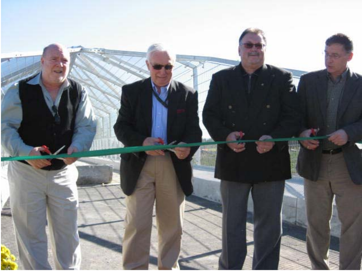
Opening Ceremonies October 21, 2007 Officials from Trans-Canada Trail Foundation, City of Kitchener City of Cambridge Region of Waterloo