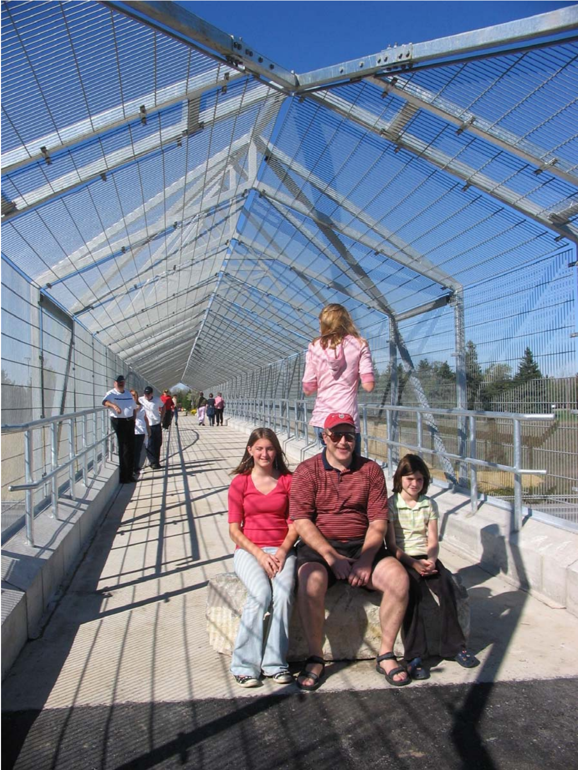
The Bridge improves accessibility AND is a great urban space