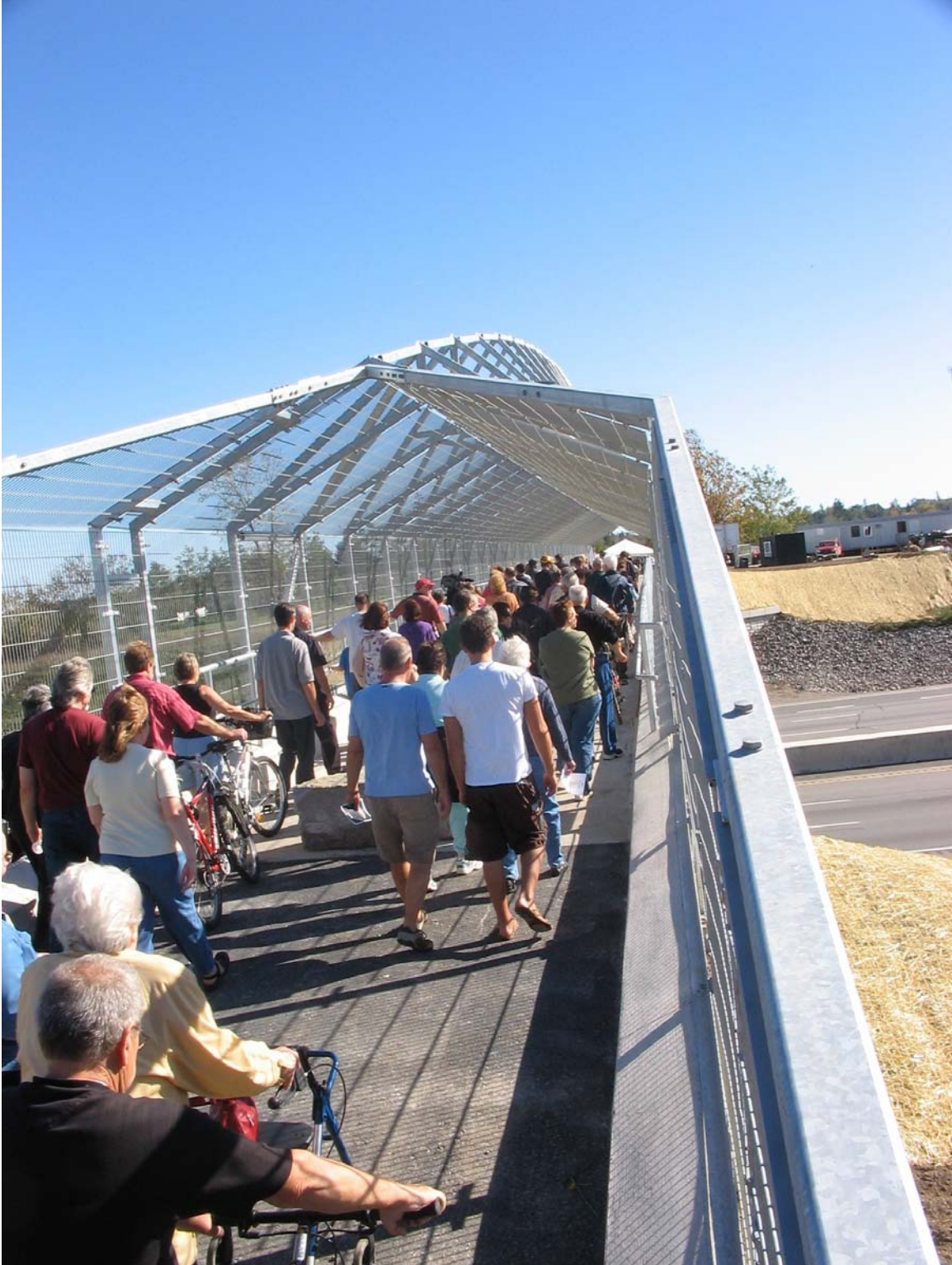
More than 300 people attended the official Opening Ceremonies, eager to be the first to officially cross their bridge