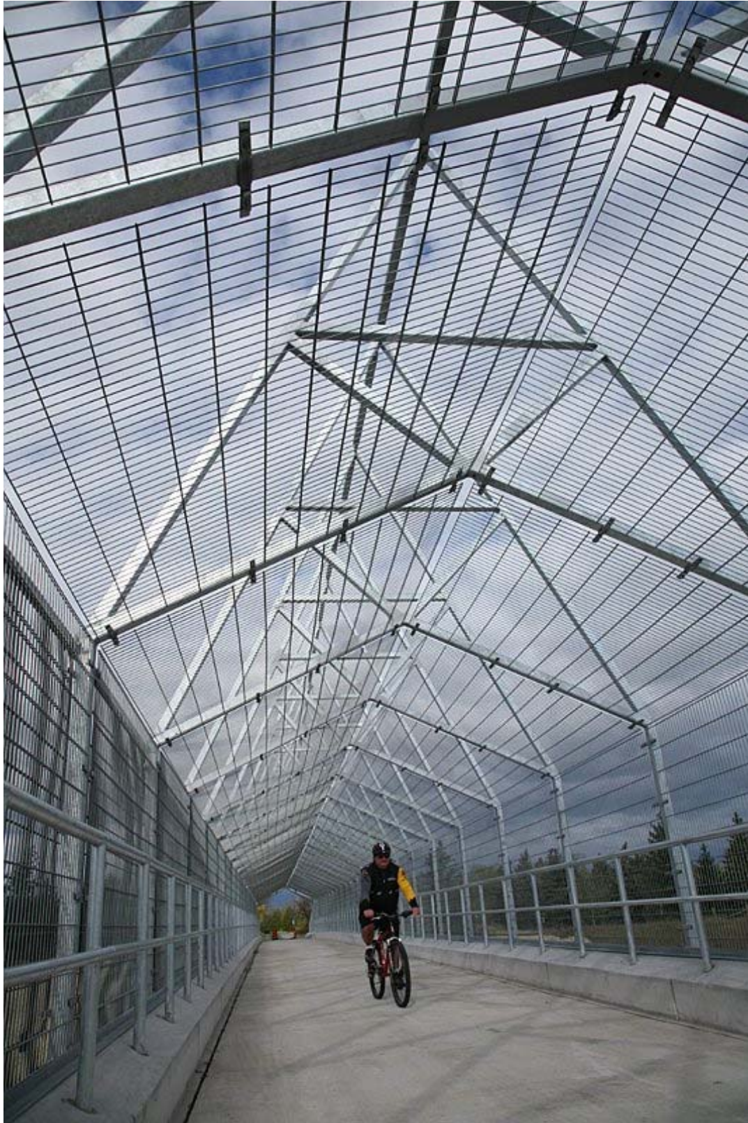
The open-air mesh design limits the amount of snow and ice accumulation on the structure, which was a key design consideration