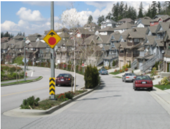
Forest Park Way Frontage Road

The city now employs every effort to discourage direct single family driveways onto collector routes. Narrow frontage roads, shared driveways and on-site turnarounds are practical alternatives to direct driveway connections. Even with topographical constraints, a narrow (5 m wide pavement) frontage road was employed on a hillside collector route after lengthy negotiations with the developer. See figures below.