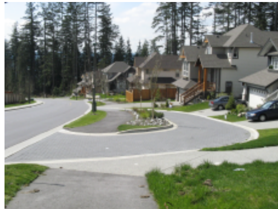
Forest Park Way Short Frontage Road