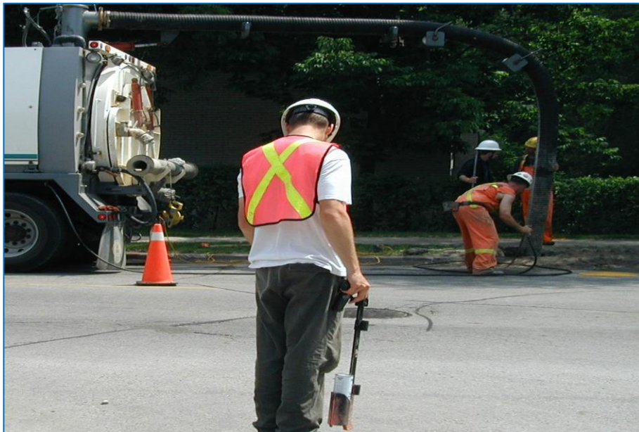
Known as the “daylighting” phase in SUE, vacuum excavation makes it possible to identify the precise vertical and horizontal positions of buried assets.