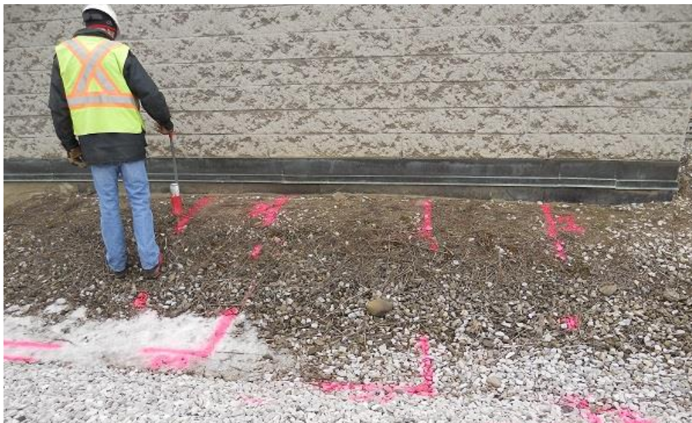
During the Go Transit expansion, non-destructive geophysical methods were leveraged to detect buried cables and utilities that crossed the corridor. Collected data was then verified and stored in a database to be used by contractors for years to come.

Traditional survey techniques were also combined with LiDAR data to model the corridor in 3D, providing an accurate perspective of corridor dimensions. Explains Florin: “Trains are protected by a clearance envelope through a very narrow tunnel. 3D modelling provides a detailed perspective and better line of sight, allowing us to make more accurate measurements for corridor routes.”