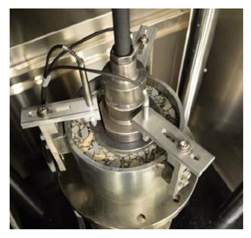
Figure 7. The Uniaxial Shear Tester.