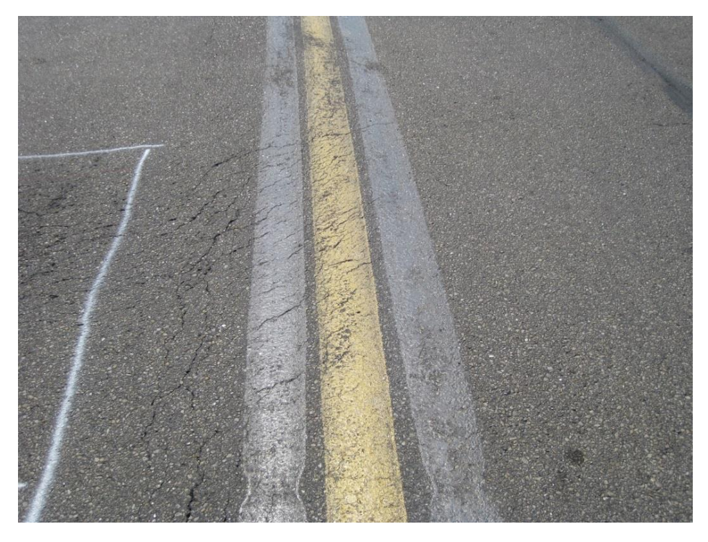
Figure 5. Example of airfield pavement shoving, cracking and slippage.