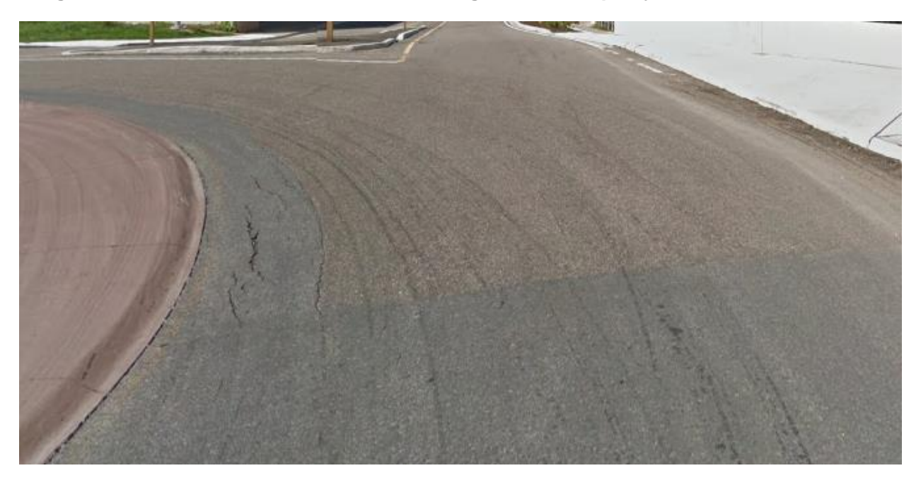
Figure 2. Example of distresses of asphalt pavement at roundabouts.