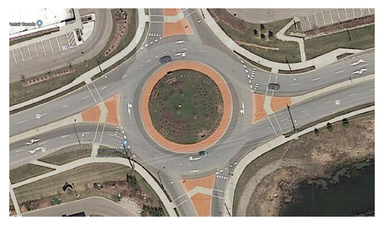
Figure 1. Roundabout constructed in the Regional Municipality of Waterloo in Ontario.