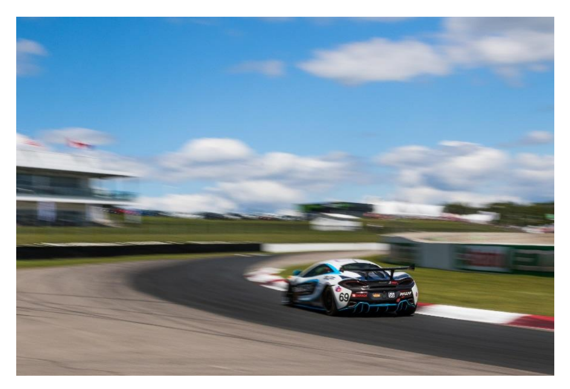
Figure 9. A race car on the asphalt pavement placed at Mosport Race Track in 2013. The pavement is in very good condition.