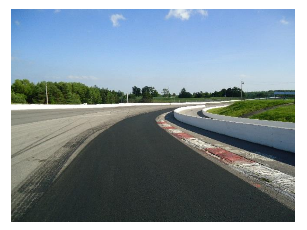
Figure 8. Advanced asphalt pavement placed on Mosport Race Track in 2013.