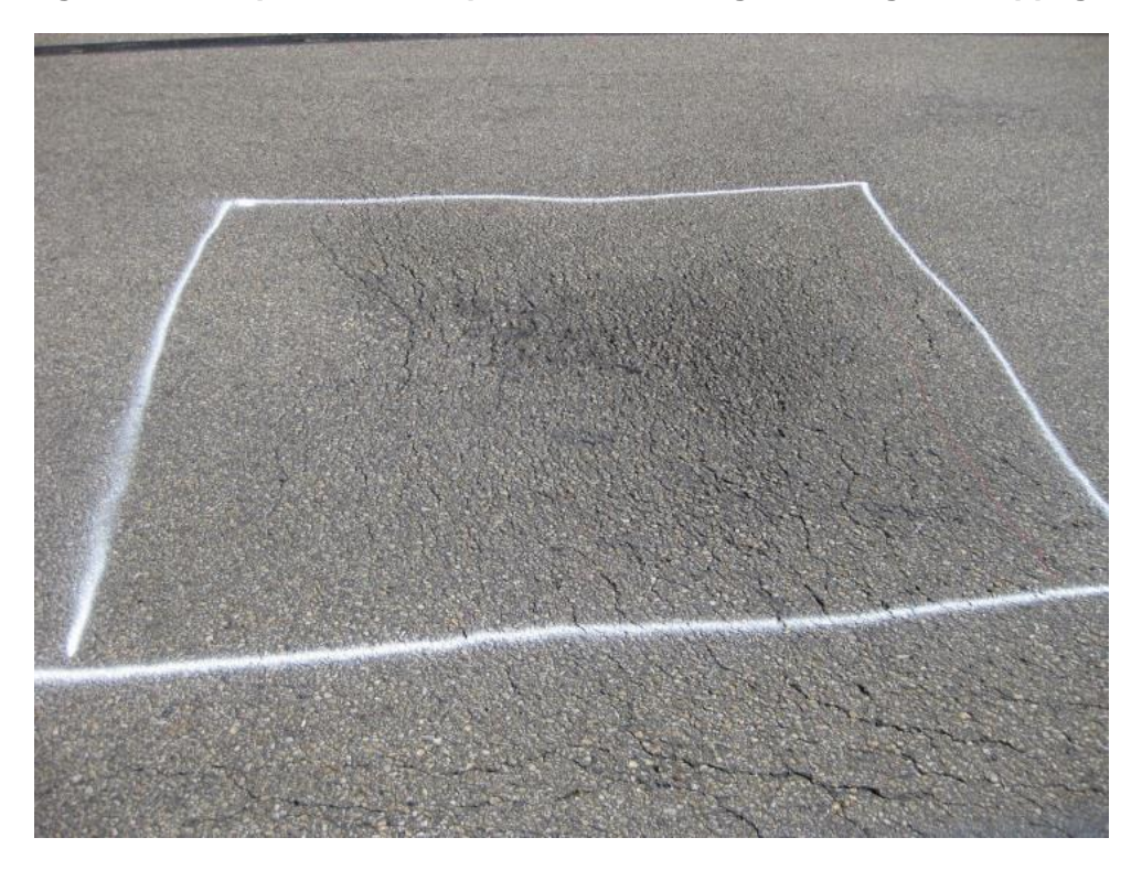
Figure 6. Example of airfield asphalt pavement severe shoving.