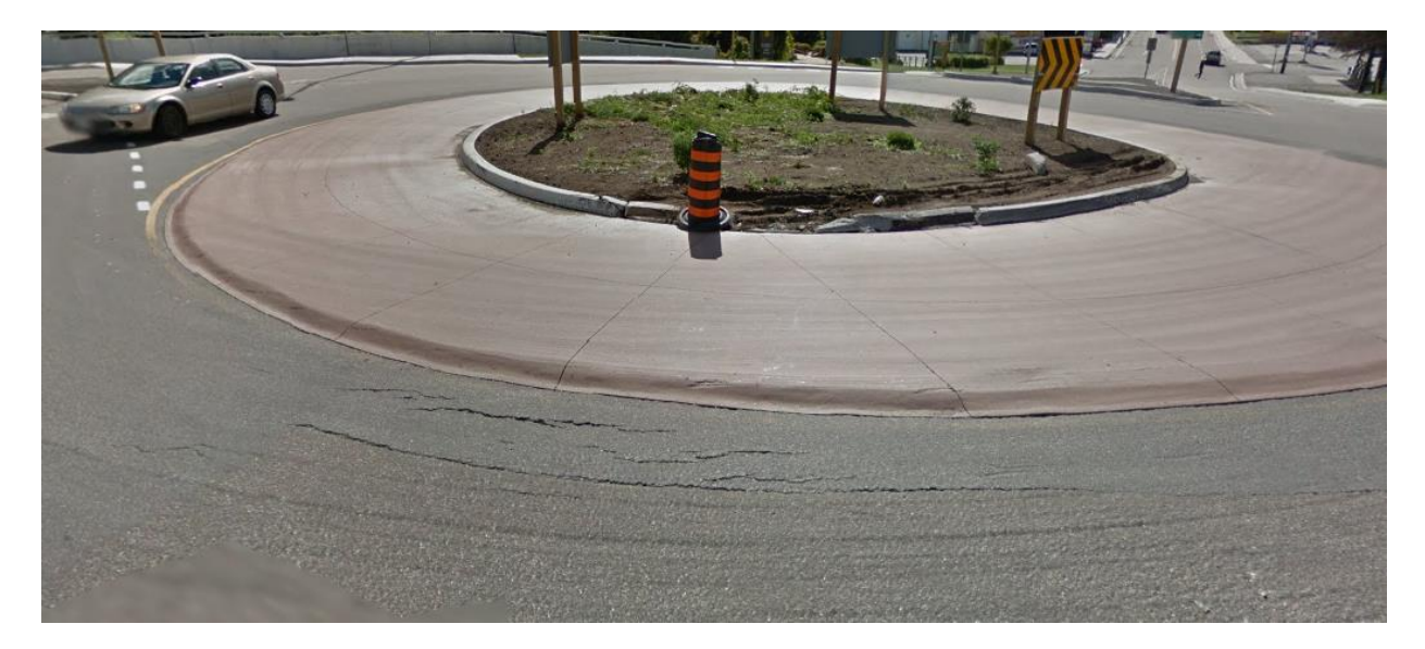
Figure 3. Example of distresses of asphalt pavement at a roundabout. Asphalt shoving, cracking and slippage are clearly visible.