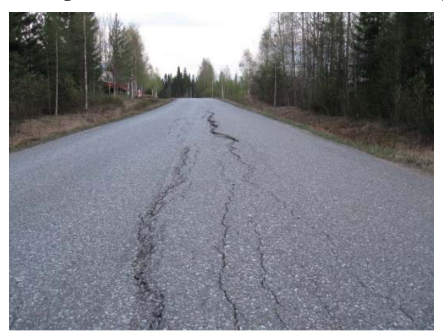
Figure 2. Severe cracking on a rural pavement due to frost heaving.

Figure 1. Frost heaving deformation at an intersection in a vicinity of a manhole.