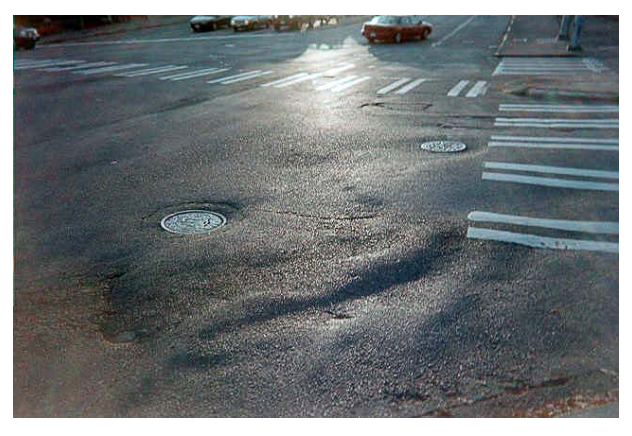
Figure 1. Frost heaving deformation at an intersection in a vicinity of a manhole.

Some agencies and pavement designers believe that reducing the thickness of granular layers in the pavement structures is sustainable by reducing the amount of depleting aggregates. Some designers also believe that by using pavement reinforcement systems such as geogrids or by stabilizing the soils, the thickness of granular layers can be significantly reduced. However, in the Canadian cold and wet climate, the main functions of the granular layers is providing good subsurface drainage and frost protection. Unjustified reduction in the thickness of the granular layers may result in pavement heaving in winter and deformation and cracking during the spring thaw period. Poor performance will increase the life cycle cost of the pavement and will have a negative impact on pavement sustainability.