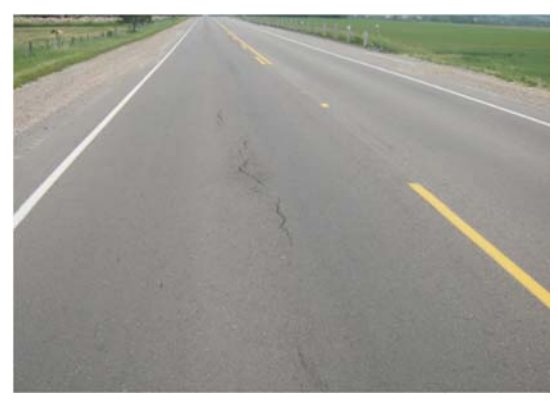
Figure 3. Midlane cracking of a 6 months old pavement on Bleams Road in Region of Waterloo.

Poor asphalt pavement performance has been observed in numerous municipalities in Ontario over the last few years. It included mainly premature cracking and raveling. Some of the observed issues were described in a technical paper presented at CTAA in 2015 [1]. In Southeastern Ontario, the standard asphalt cement grade is PG 58-28, which is often bumped to PG 64-28 for heavier, slow-moving traffic, and even to PG 70-28 for very heavy, slow-moving or static traffic. The observed pavement problems were mainly with the pavements where the asphalt mixes incorporated PG 64-28 or 70-28 grades. Pavements that were considered to be properly designed and had good Quality Control/Quality Assurance (QC/QA) results exhibited extensive cracking after 2 to 3 years and sometimes after less that a year. Figures 3 to 5 show typical cracking of those pavements. The most visible is the medium severity midlane cracking. Low severity random cracking was also observed. Careful pavement inspection also revealed extensive pavement microcracking. There were concerns that the problems were mainly due to the irresponsible use of Recycled Engine Oil Bottom (REOB) and Reclaimed Asphalt Pavement (RAP), lean mixes and some mix production issues. Customized asphalt paving specifications were developed for some of these municipalities. They also included special provisions for asphalt cement.