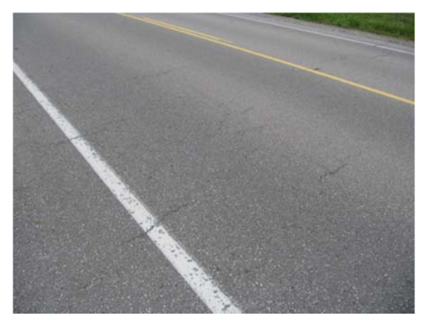
Figure 5. Check cracking on Moser Young Road in Region of Waterloo.

As a result of the poor performance observed in the field, customized specifications in five large municipalities in Ontario, Regions of Waterloo, Niagara, Durham, Peel and York, were developed and implemented in 2015. The Regions introduced customized specifications or special provisions for asphalt cement to update the requirements of Ontario Provincial Standard Specification (OPSS), OPSS.MUNI 1101 Material Specification for Performance Graded Asphalt Cement, 2013 [2]. The changes included restriction on some of the asphalt cement modifiers, particularly REOB, and the addition of advanced laboratory testing. These additional tests were: