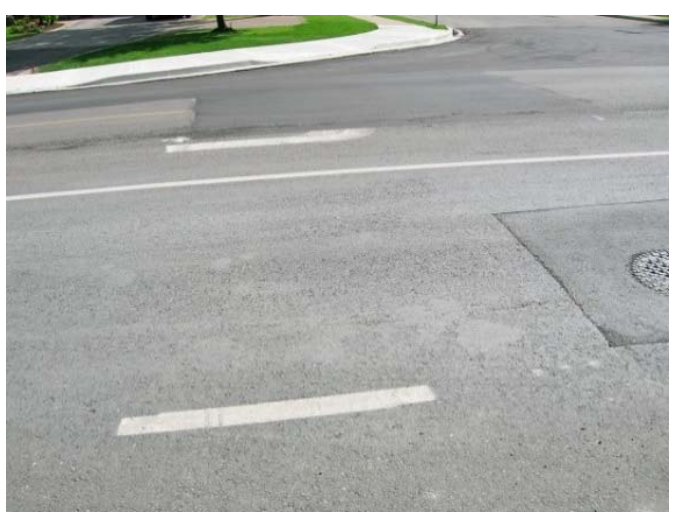
Figure 8. Raveling and cracking of new binder course that incorporated very high content of RAP.

Due to the fact that some poor performance of Superpave asphalt mixes as observed in the past was related to poor durability, resulting in raveling and cracking, some of the recent customized specifications were focused on ensuring that enough asphalt cement is incorporated in the mix and the amount of RAP in the mix is controlled. Some of the customized specifications and/or special provisions updated OPSS.MUNI 1151 "Material Specification for Superpave and Stone Mastic Asphalt", 2006 [11] and included the bidding asphalt cement content and minimum asphalt cement content in the mixes.