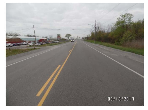
Figure 11. Excellent current condition of asphalt pavement placed in the Region of Niagara in 2016.

Figure 11 and 12 shows examples of excellent quality asphalt pavements that were paved in the Region in 2016.