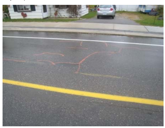
Figure 9. Cracking of new binder course that contained high percentage of RAS.

Figures 9 and 10 show a new binder course that incorporated 5.0 percent RAS and 15 percent RAP in the mix. The binder course developed extensive cracking shortly after paving and required extensive and costly repairs.