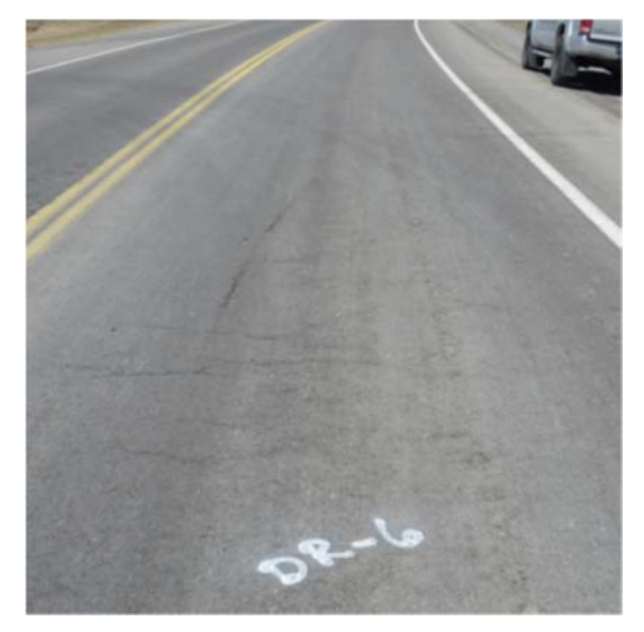
Figure 4. Premature pavement cracking on Region of Niagara Regional Road 25 Doan's Ridge Road.

Figure 3. Midlane cracking of a 6 months old pavement on Bleams Road in Region of Waterloo.