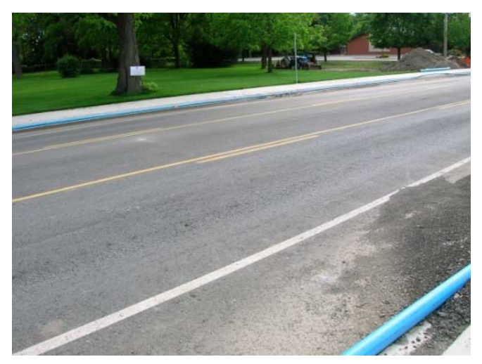
Figure 7. Raveling of new binder course mix that incorporated very high content of RAP.