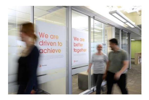
Figure 1 – Stantec's Core Values

Part of our commitment to do what is right relates to how we carry out our project work. Stantec's Project Management (PM) Framework was first developed in the mid-1980s. Our firm, then known as Stanley Engineering, was in the early stages of bidding for the first of several contracts to manage the extension of the Edmonton LRT. One of our VPs saw the need to introduce project management protocols in order to succeed in a project of this size; it was this readiness to innovate that won us the work and sparked the development of our quality management framework.