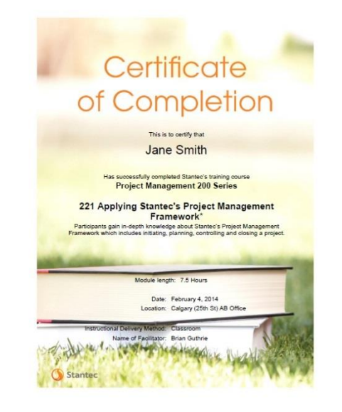
Figure 7 – Boot Camp Certificate of Completion

As a result of these Project Management Boot Camps, our Project Managers (PMs) are better equipped to provide quality in all our services—including our transportation design work—while following all appropriate codes, standards, financial constraints, and ethical guidelines. Because of our increased focus in the last 10-20 years on project management protocols and the development of our quality management framework, our projects are delivered to our clients on schedule, on budget, and within scope. Risks are reduced, not only for Stantec but also for our clients. Meanwhile, we are nurturing an internal network of excellent PMs, who will be able to manage larger and more complex projects in future.