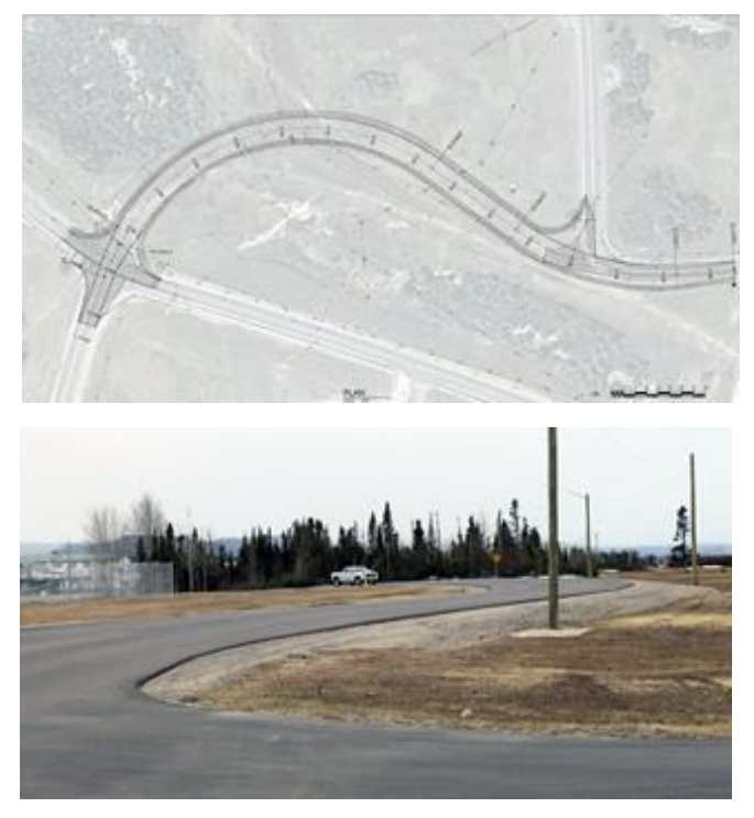
Figure 8 CFB Goose Bay, Vulcan Road Extension

Our Project Managers (PMs) live in the communities where they work, and every Stantec employee has a personal interest in improving the lives of their neighbours with safe, sustainable design. Every PM who participates in a Stantec PM Boot Camp is a community member who cares deeply about the lives they affect with their work. The PMs in our Transportation sector know that the transit systems, roads, terminals and bridges they design today will carry their friends and family to work, school, and play. The ultimate value of Stantec's PM Boot Camps to the Canadian transportation community is improved project quality and design for transportation systems across Canada, including our traffic systems, roads, bridges, transit systems and airports.