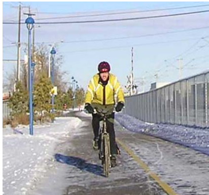
Example of fenced section