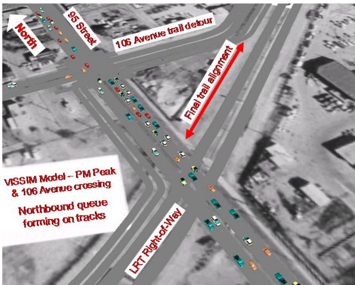
VISSIM snapshot of 106 Avenue trail detour option and maximum northbound vehicle queue during PM peak hour on 95 Street – potential for vehicles to block LRT tracks

Installing a marked zebra crosswalk at the LRT tracks was considered, however the additional costs and operational modifications required for a signal were adopted. It is noted that on lower volume roadways, marked zebra crosswalks are providing adequate levels of protection. Similarly, marked crosswalks can also prove effective on high volume roadways, dependent on geometric and operational constraints.