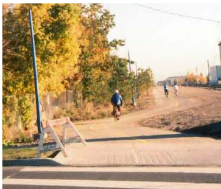
Reverse curves forewarn upcoming intersection

Integrating the RWT with the surrounding roadway network involved several inventive measures. To alert trail users to intersecting roadways, gentle 60-degree reverse curves were incorporated into the trail that contrast with the otherwise uninterrupted, straight trail alignment. Signage consistent with the Manual of Uniform Traffic Control Devices warns trail users of both the roadway and the parallel rail.