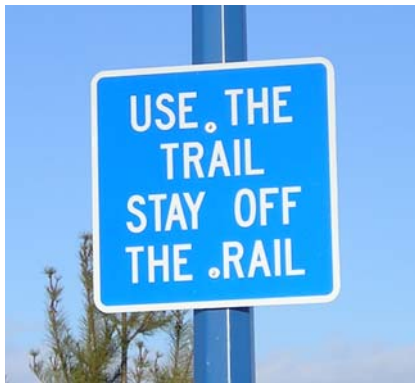
Informative signage poetry

The Safety Audit recommended a minimum of 4.6 metres horizontal separation, preferably 7.6 metres. The 2005 trail construction includes sections of trail that are adjacent to storage tracks and 1.2 metre high fencing is included in these locations. Fencing is also necessary close to roadway intersections to prevent shortcutting across the tracks to the roadway. To reduce likelihood of trespassing on the tracks, the trail domain is well defined with overhead lights, landscaping and signage. The even rolling asphalt trail surface is also more desirable for non-motorised travel.