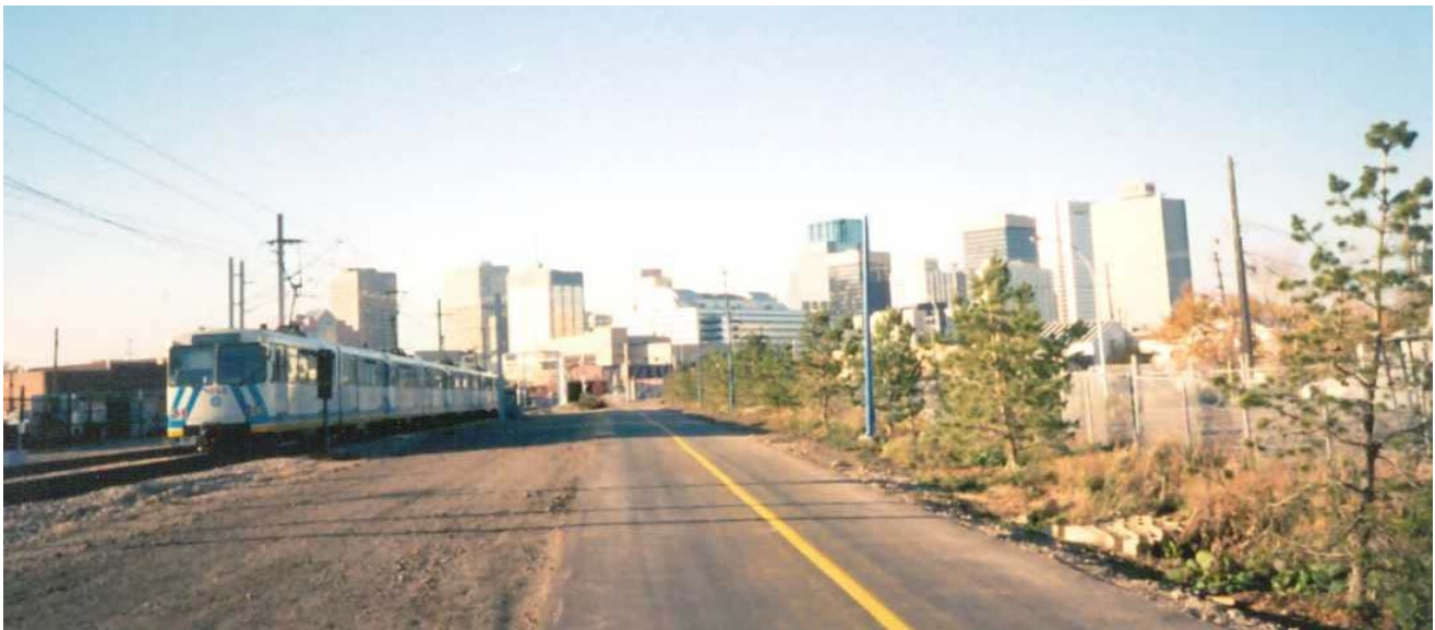
Looking southwest from 93 Street along the LRT RWT towards the Downtown Edmonton skyline

Commencing in 2006, an additional 4.1 km of trail construction is planned to connect northward through to 137 Avenue and the North Saskatchewan River Valley. At the Downtown end, the trail will be completed across the former CN Bridge at 97 Street/105 Avenue when the former station lands site is developed. 105 Avenue has been identified as a "greenway" corridor with a multi-use trail complementing the adjacent residential, educational, commercial and industrial properties.