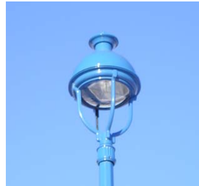
Overhead halogen lighting