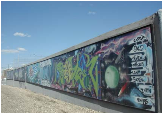
Graffiti mural created by seven community artists