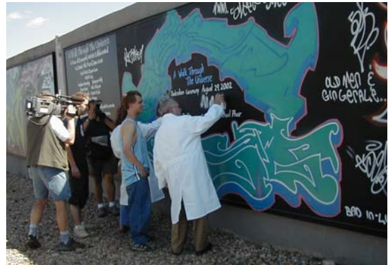
Councillors add their tags at the mural opening