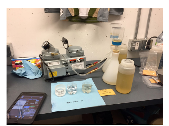
6. eDNA filtration equipment DETECTION RELIABILITY

Understanding transport of eDNA in both lentic (still water) and lotic systems (flowing water) is also a key component of survey design. System hydrodynamics are considered: large, open, aquatic systems with short water residence-time and rapid mixing (i.e., lotic systems) require different interpretative approaches relative to small, semi-enclosed water bodies with limited exchange (i.e., lentic systems).