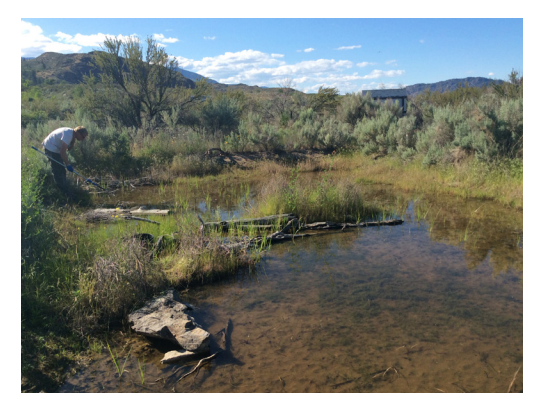
4. eDNA collection from a pond (lentic) system

Hemmera's success in eDNA sampling and analysis provides clear evidence of the utility of this approach. Hemmera has used eDNA techniques to substantially improve delivery of cost-effective, relevant, and accurate data, particularly when compared with traditional survey methods. The spatial and temporal accuracy that eDNA detections of species of management interest has dramatically improved our ability to advise clients on balancing environmental protection and economic development objectives.