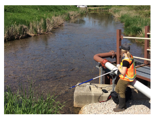
1. Assessing habitat of a larger stream in preparation for eDNA