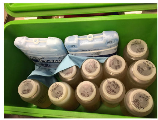
5. Storage to preserve eDNA samples prior to filtration

Use of eDNA has helped prove PWS absence and avoided the need for high cost salvage operations. We note that eDNA is not a replacement for salvage – rather eDNA is a relatively economical, non-intrusive and efficient means of determining whether salvage is required.