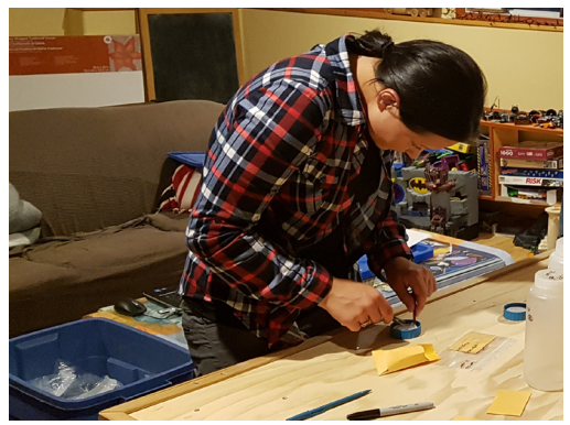
7. eDNA filtration in process

Just as in courtroom dramas, skepticism about the reliability of eDNA results within the professional and regulatory community is widespread. Surprisingly, resistance to the use of eDNA has persisted despite repeated demonstration of poor efficacy (i.e., low detection probabilities) of traditional survey techniques. Hemmera has been instrumental in developing and implementing improved field and laboratory practices and procedures to limit analytical errors (i.e., false positives and false negatives) and thereby, directly addressing previous limitations of eDNA use. Communicating these successes and the reliability, efficiency, and cost benefits of eDNA has been helping to changing skeptics into supporters.