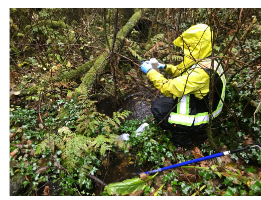
2. eDNA collection from a smaller stream

Hemmera's submission discusses how environmental DNA (eDNA) can be used to quickly and cost-effectively detect aquatic and semi-aquatic species, particularly for at-risk and invasive species.