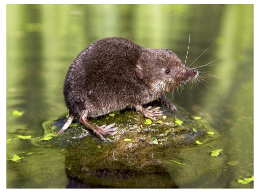
Pacific Water Shrew