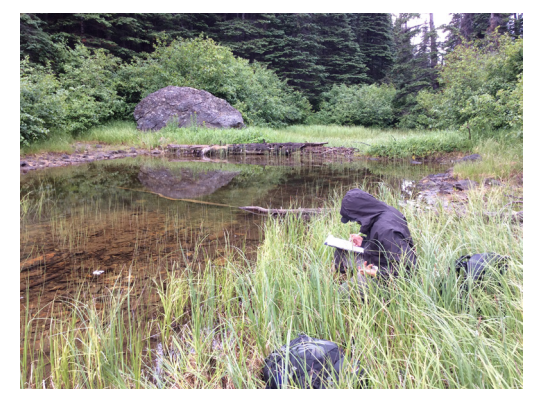
3. Assessing pond (lentic) habitat in preparation for eDNA