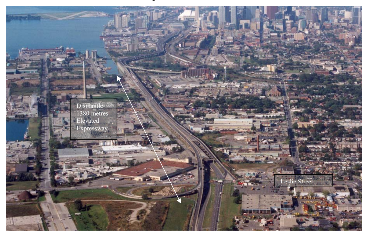
F.G. Gardiner Expressway East Dismantling Looking West from Leslie Street