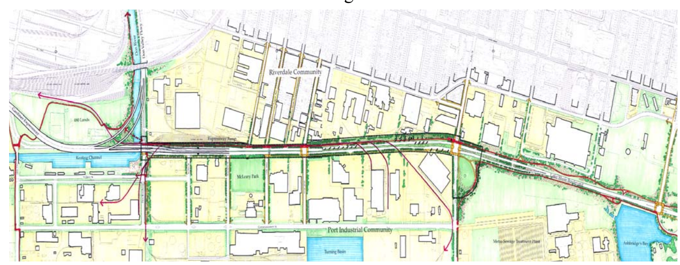
Urban Design Plan

The Gardiner Expressway between Leslie Street and the Don River has been replaced with a four lane arterial road with a centre median. At the very easterly end, close to the Don River and at the new terminus of the elevated expressway, the highway ramps down to Lake Shore Boulevard. Pavement markings, signage and rumble strips warn eastbound motorists that there is a change in roadway environment coming up and that they should slow down. 400 metres from the ramp terminus is the signalized intersection at Carlaw Avenue which completes the transition from expressway to city street. The drawing below shows the overall plan for the project.