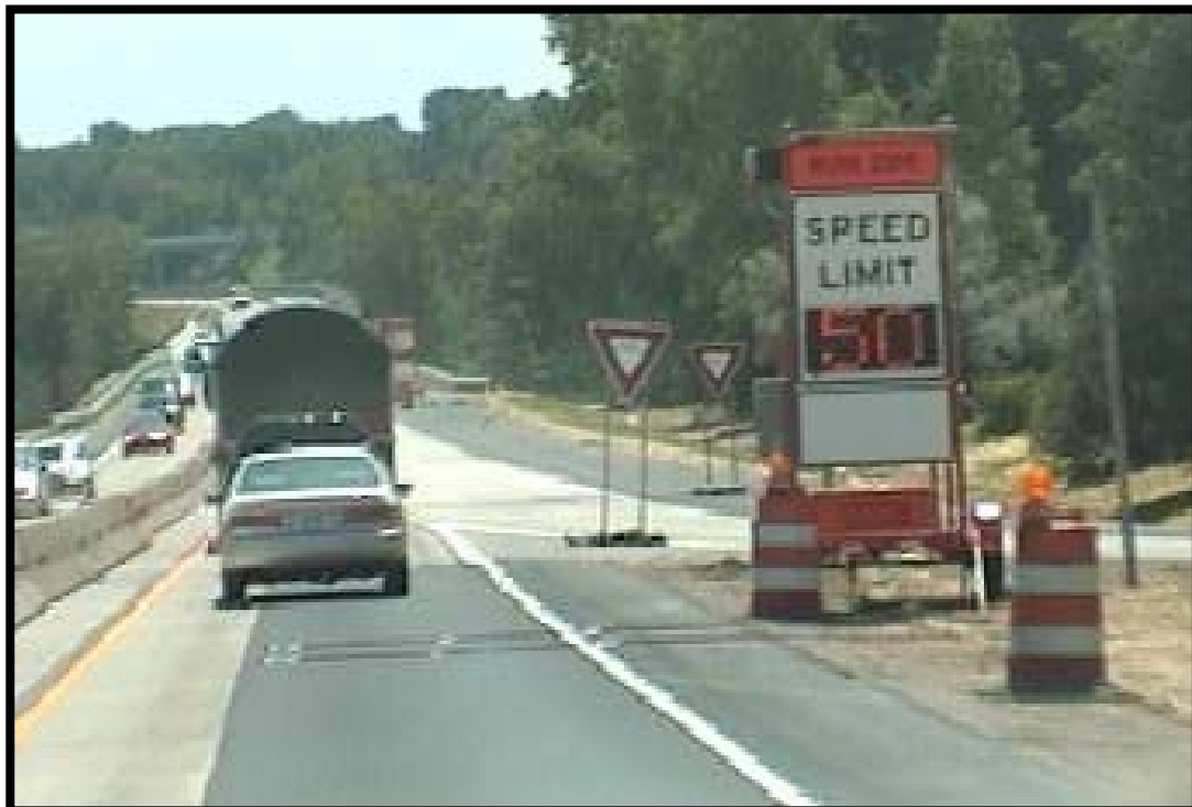
Figure 2: Variable Speed Limit system in operation