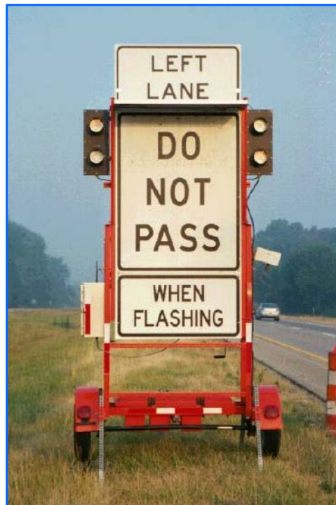
Figure 1: Dynamic Lane Merger Deployed On I-69 Near Lansing, Michigan