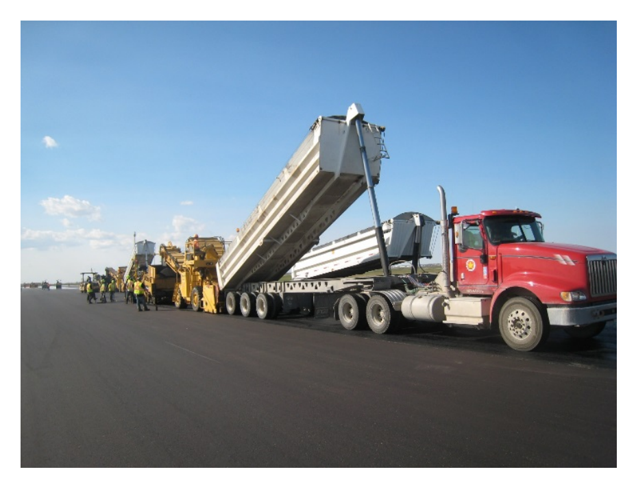
Photograph 18: Echelon paving of surface course.