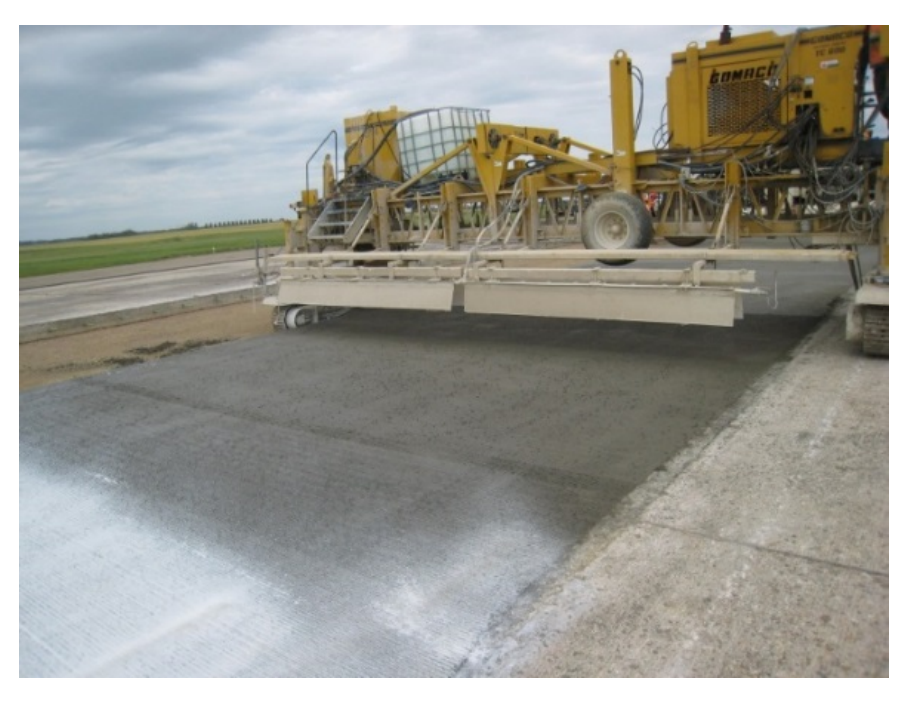
Photograph 5: Construction of new slabs on Runway 02-20.

The pavement rehabilitation on the runways at EIA typically includes the milling of the existing asphalt and placing new asphalt on the centre 14 m of the runway. Photograph 5 shows construction of new slabs on Runway 02-20 and Photograph 6 shows a cross stitched crack. The pavement rehabilitation on Runway 02-20 included concrete slab removal in Row 1 on both sides of the centerline and localized slabs in other rows.