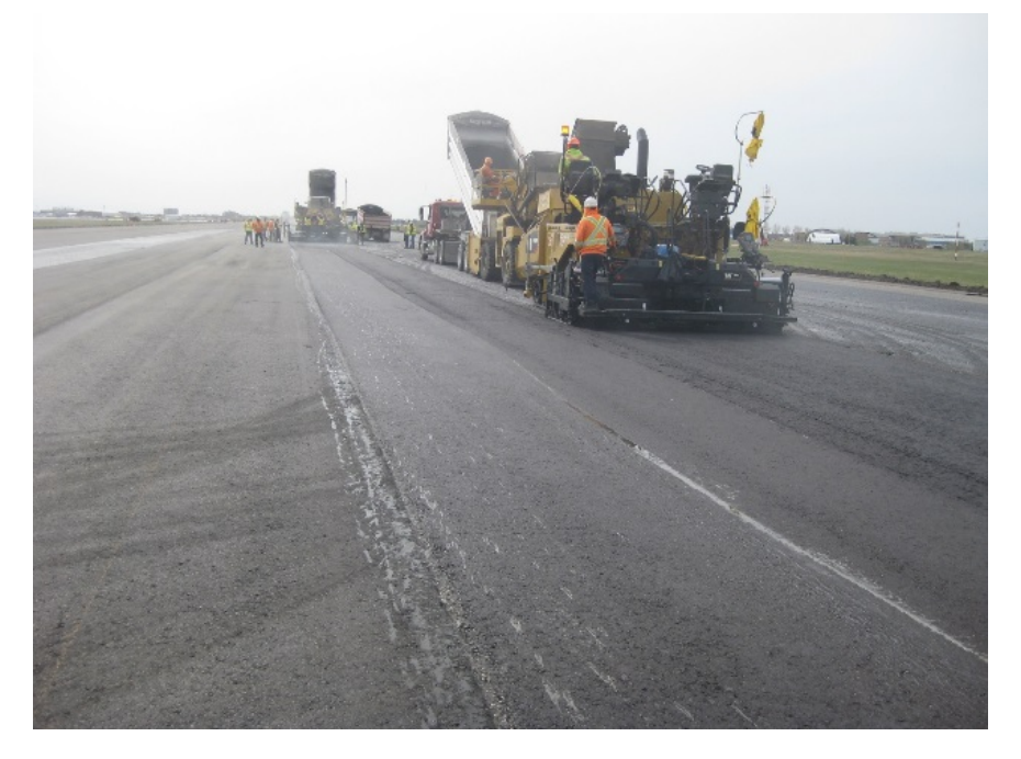
Photograph 14: Echelon paving of the lower course.

Photograph 14 shows echelon paving or the lower course mat and Photograph 15 shows the edge of the mat. Since both pavers used for lower course and surface course paving had excellent side confinement, as shown in Photograph 16, the edge of the paved mats was very good as can be seen in Photograph 15. The mat did not have to be cut or trimmed for cold joint construction. Photograph 17 shows the GlasGrid® application beneath the asphalt lower course to mitigate the potential for reflective cracking.