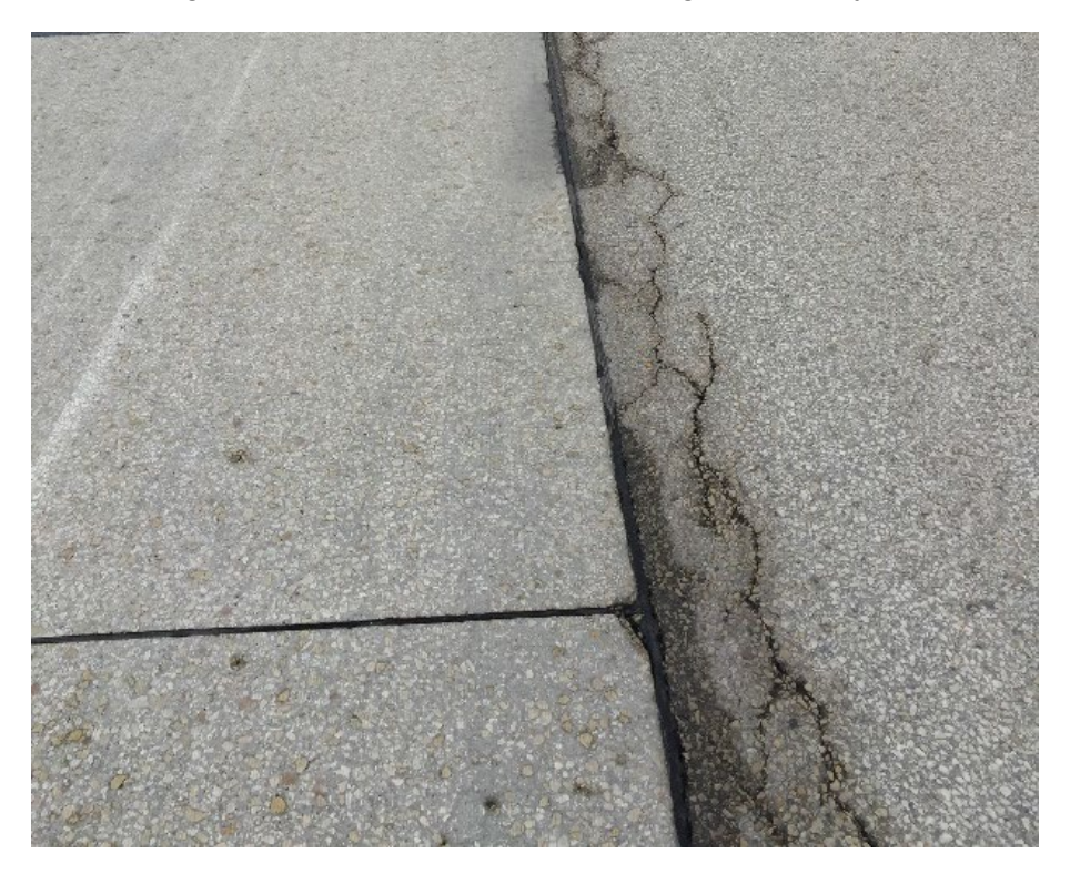
Photograph 12: Severe longitudinal crack along the concrete/asphalt interface.