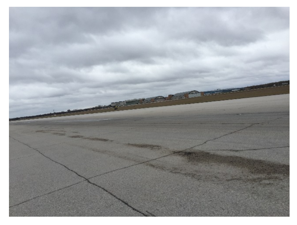
Photograph 11: Localized severe raveling on Runway 13-31.