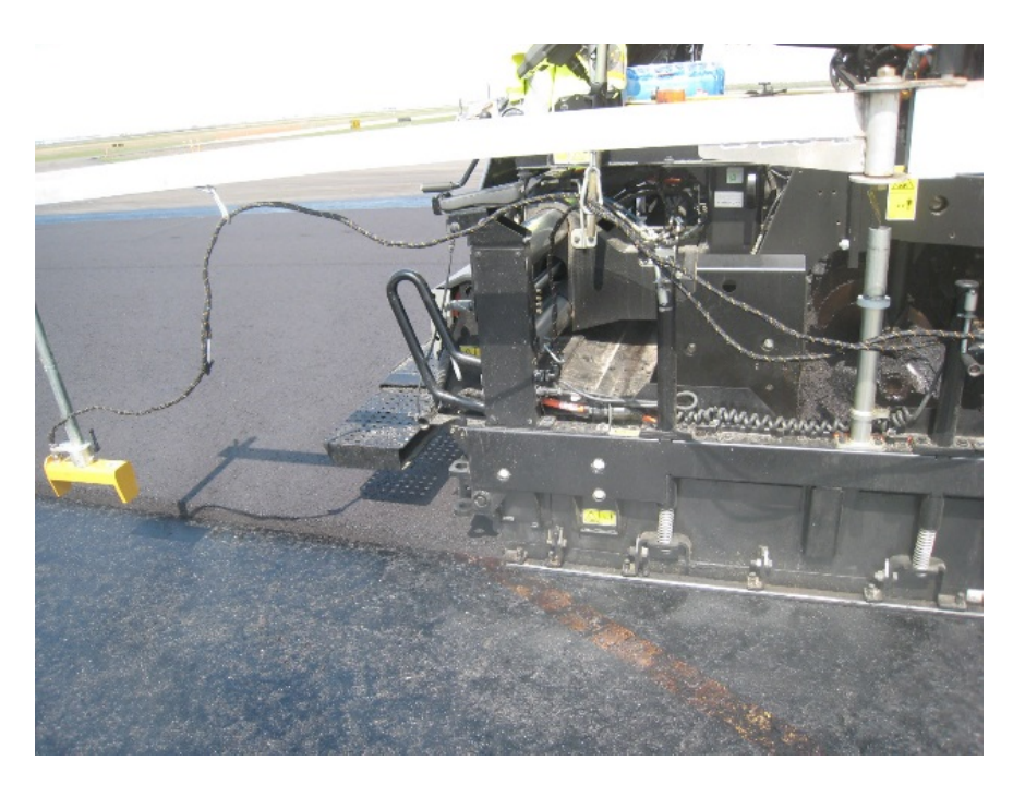
Photograph 16: Excellent side confinement provided by the paver.