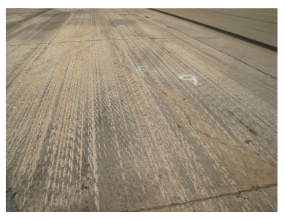
Photograph 6: Example of cross stitched crack in concrete slabs.