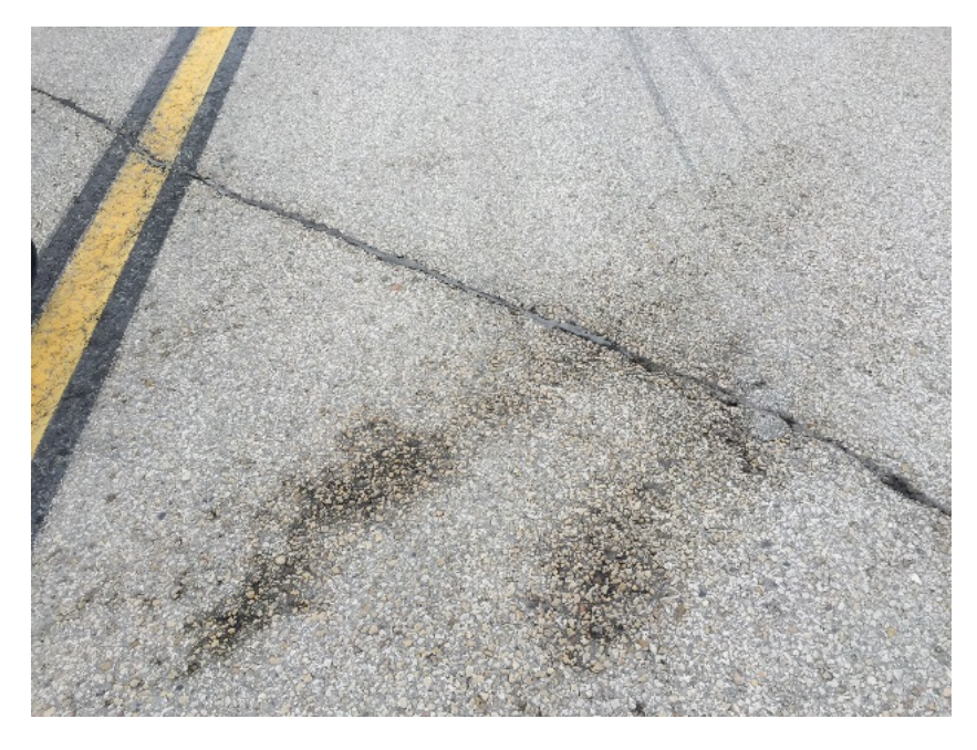
Photograph 13: Ravelling, cracking and polished aggregate.

Traditionally, 150/200 A asphalt cement is used in the Winnipeg area and was used at WIA in the past. It was decided to take advantage of the improvements in asphalt cement technology and use Performance Graded (PG) asphalt cement during the pavement rehabilitation. The selected grade was PG 64-37 P (polymer modified).