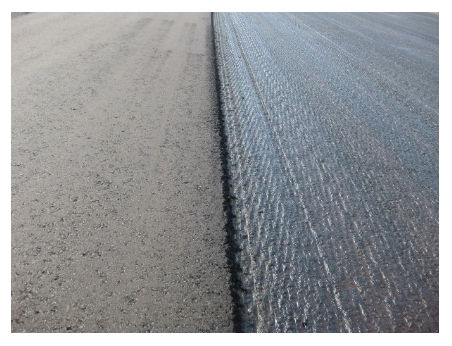
Photograph 15: Paved mat of the lower course. The edge is of very good quality.