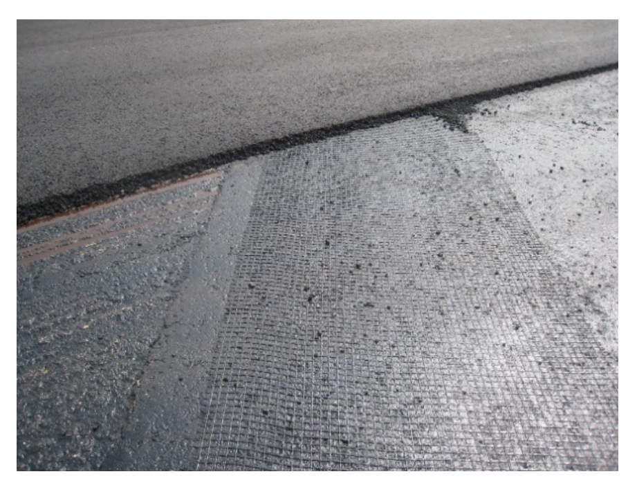
Photograph 17: GlasGrid® placed on existing pavement below the lower course.

Photographs 14 and 18 show echelon paving of the base course and the surface course mat, respectively. The quality of the surface course mat is excellent, and the longitudinal joints are very tight, as shown in Photograph 19.