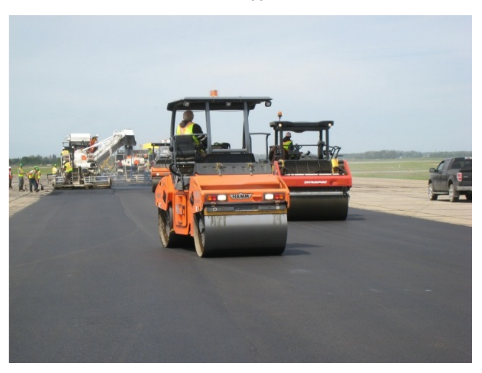
Photograph 9: Compaction operation on Runway 12-30.