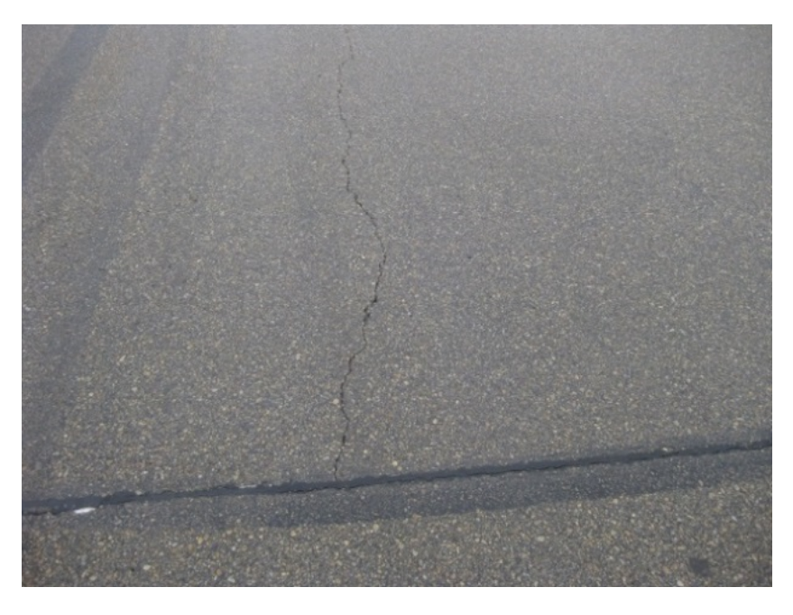
Photograph 2: Typical medium severity reflective cracking on the runway pavement.