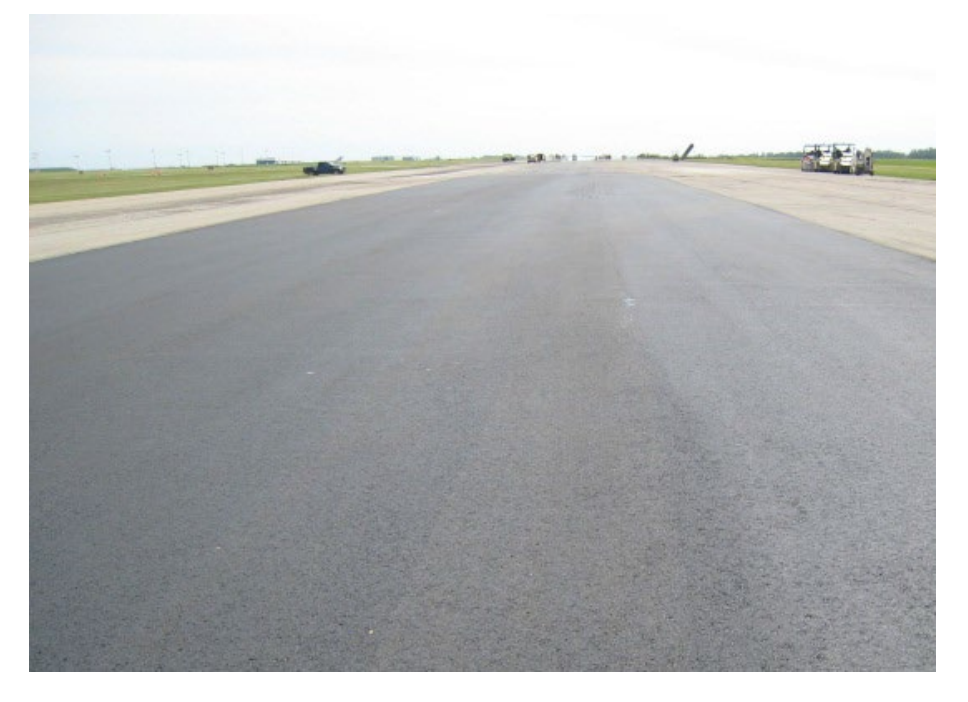
Photograph 10: Paved surface on Runway 02-20.

The smoothness is initially measured with a 3 m straight edge. Final smoothness is evaluated using an Inertial Profiler. Photograph 10 shows the final asphalt mat on Runway 02-20. The quality of the mat including compaction and smoothness was excellent.