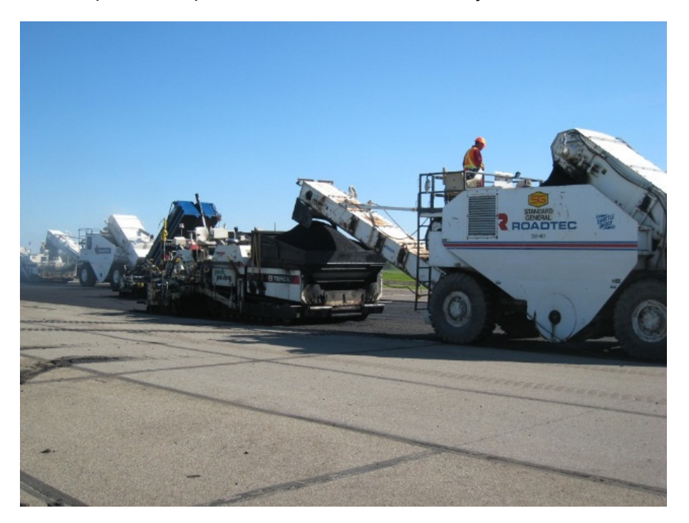
Photograph 8: Asphalt paving operation on Runway 02-20 included three pavers and two ShuttleBuggies<sup>®</sup>.

Photograph 9. Quality Control (QC) and QA testing of compaction was carried out continuously during paving and the Contractor was immediately notified if the required compaction was not being achieved. Compaction requirements for the mat and the joints were met on both runways.