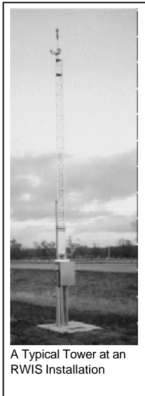
A Typical Tower at an RWIS Installation

Road Weather Information Systems (RWIS) with pavement and atmospheric sensors are now providing up-to-the-minute information to the road maintainers about what is happening at the road surface. Pavement sensors embedded in the road surface, linked to mini weather towers, collect information that is sent to a weather service. Their experts can forecast when freezing pavement conditions are likely to occur similar to the way they forecast the weather. This provides an early warning to road maintainers to have their people and trucks ready. The patrol staff relate the forecast to the actual observed conditions and the real time pavement information coming from the sensors. If they see that there is going to be precipitation, and the road temperatures are below freezing then they know that they need to put salt down. However, if the pavement temperatures are above freezing and are likely to stay there, then salt is not needed.