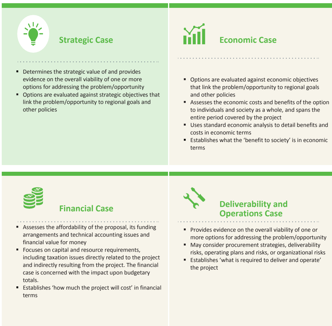
Figure 1- Metrolinx Business Case Framework